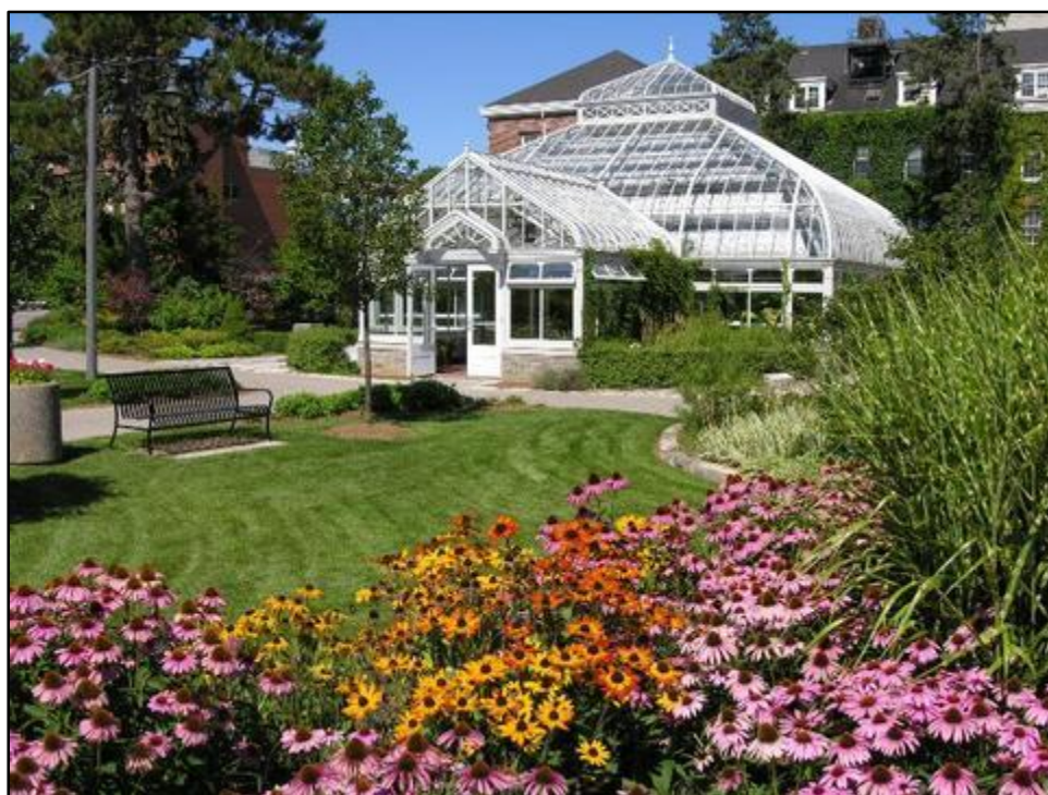
Figure 5: Rutherford Conservatory in 2006