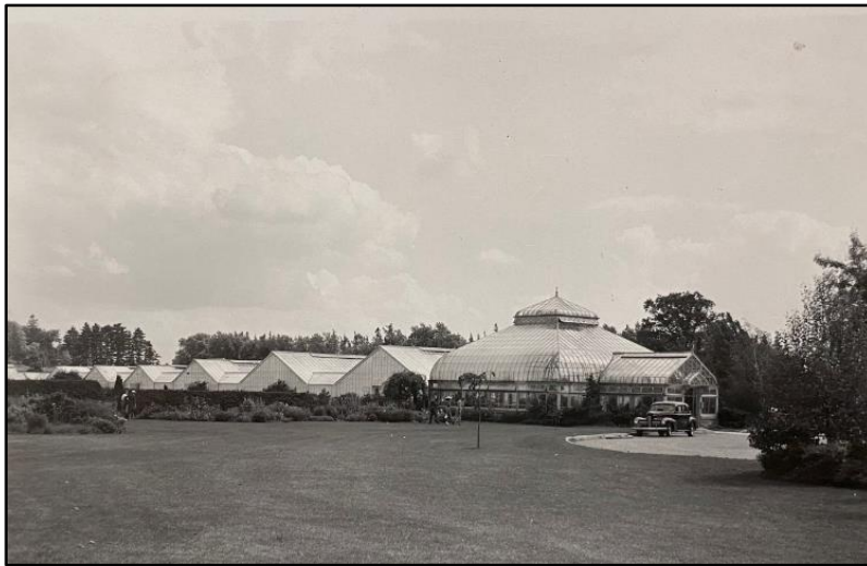
Figure 2: Department of Horticulture Greenhouses c. 1939 (U of G Archives, REI OAC AO218)

The conservatory was not only an impressive centerpiece of the Ontario Agricultural College, and later University of Guelph campus, but has functioned as a popular meeting place for generations of students, faculty, and alumni. According to the University of Guelph, “older alumni also recall it as a popular spot at which to meet for moonlit rendezvous - with more than one marriage proposal having been uttered in its midst” (University of Guelph, 1998).