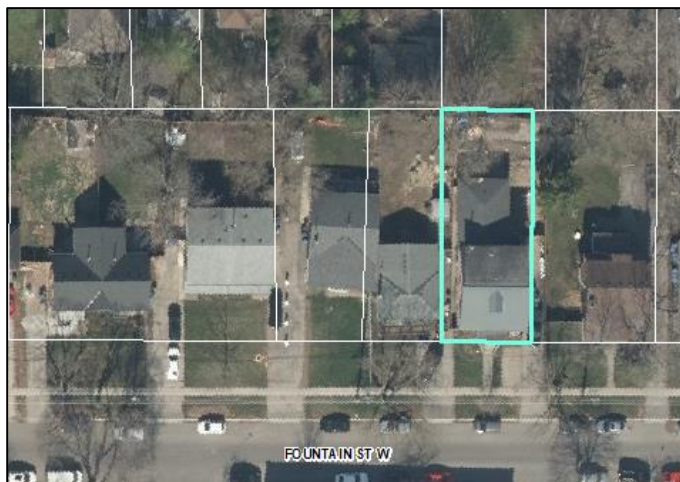
Figure 1 ArcGIS Map of 19 Fountain Street West.

The subject property is located at 19 Fountain Street West, south of Gordon St, east of Nottingham St, and north of Dublin St. The legal description is Part Lot 173, Plan 8, AS IN RO786757; GUELPH. The subject property is located within the territory covered by Treaty No. 3 of 1792, negotiated between the Mississaugas of the Credit First Nation and the British Crown, and within long established traditional hunting grounds of Six Nations of the Grand River.