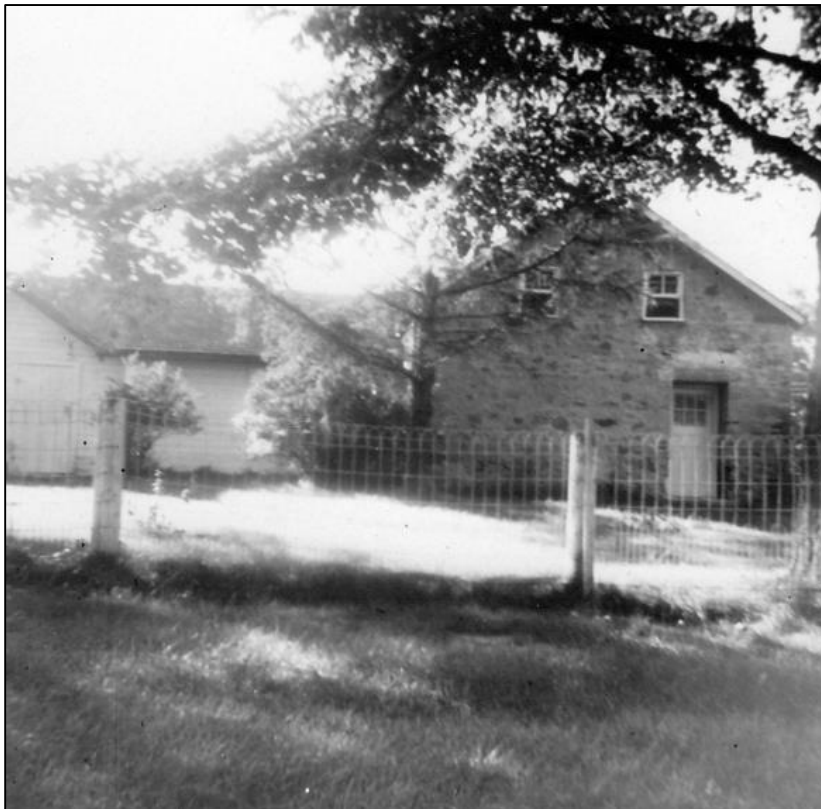
Figure 12: Picture of the Scott Homestead, as provided by Township of Puslinch Staff.