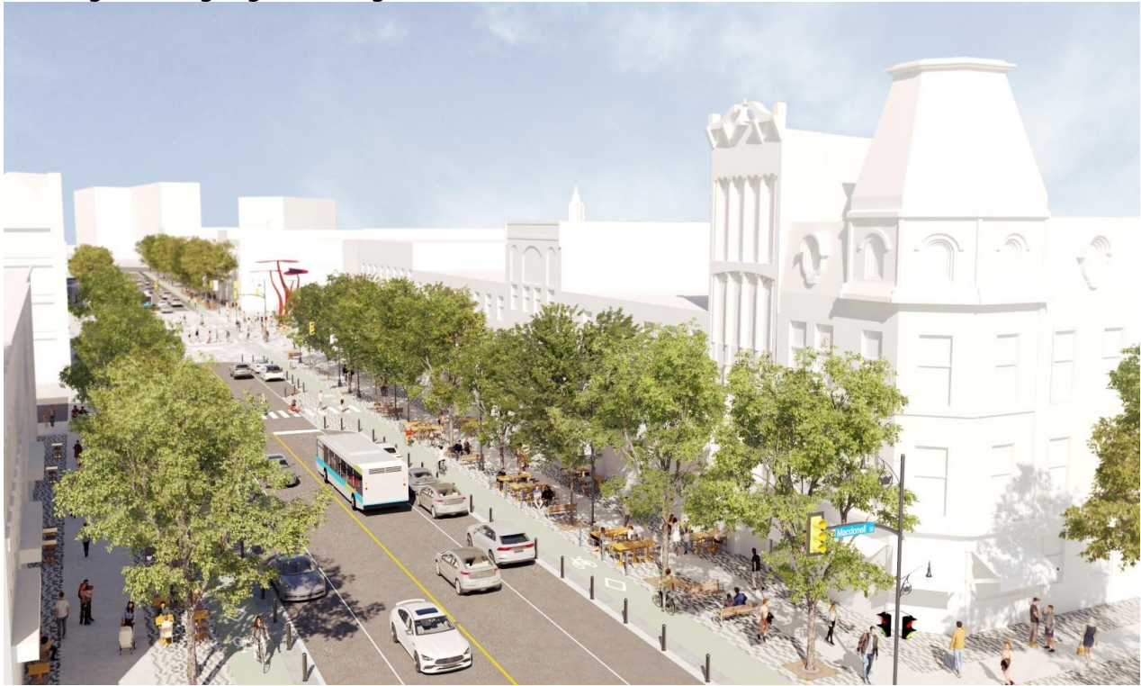
Figure 2 Streetscape Concept Prioritizing Tree Canopy, Flexible Street, Public Seating and Highlight Paving Stone