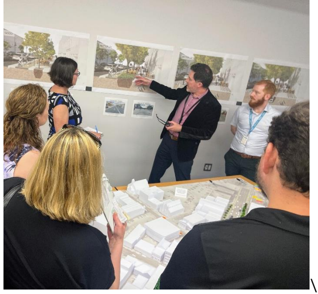
Figure 4 Detailed view of Downtown Guelph 3D Model.