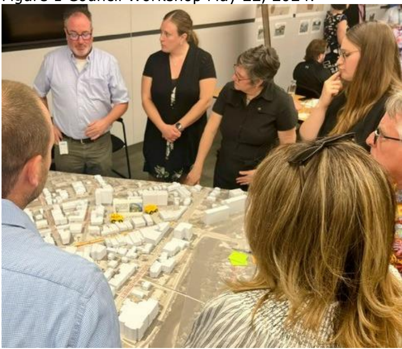
Figure 1 Council Workshop May 22, 2024.