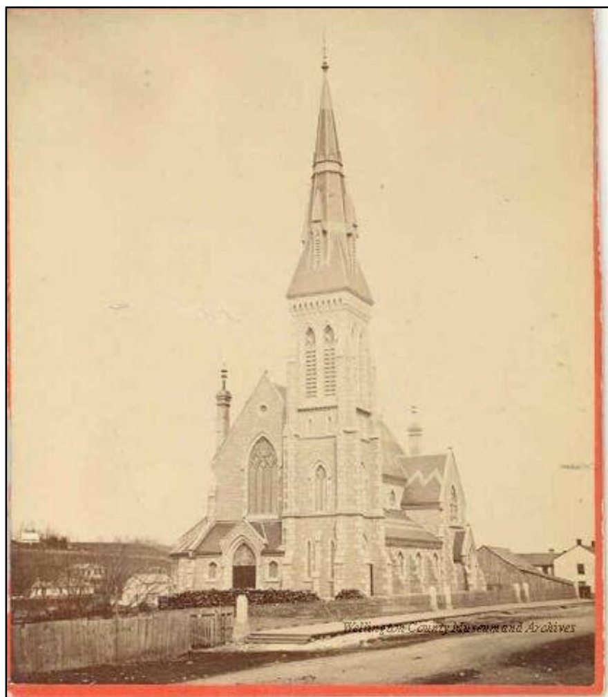
Figure 2: Photograph of St George's Church from the 1880s showing stone markers in foreground

Heritage planning staff, in consultation with the property owner, agreed to support the removal of these properties from the Municipal Register of Cultural Heritage Properties if the four stone markers could be carefully removed and re-installed at their approximate original locations at St George's Church. The property owners retained Tacoma Engineers to draft a plan to reinstall the markers. Heritage planning staff are satisfied with the proposed plan for relocation (See Attachment 1).