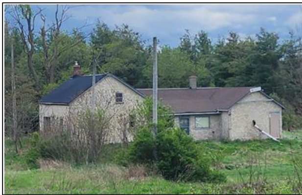
Figure 7: View from north; original limestone corner. (Heritage Planning 2024)