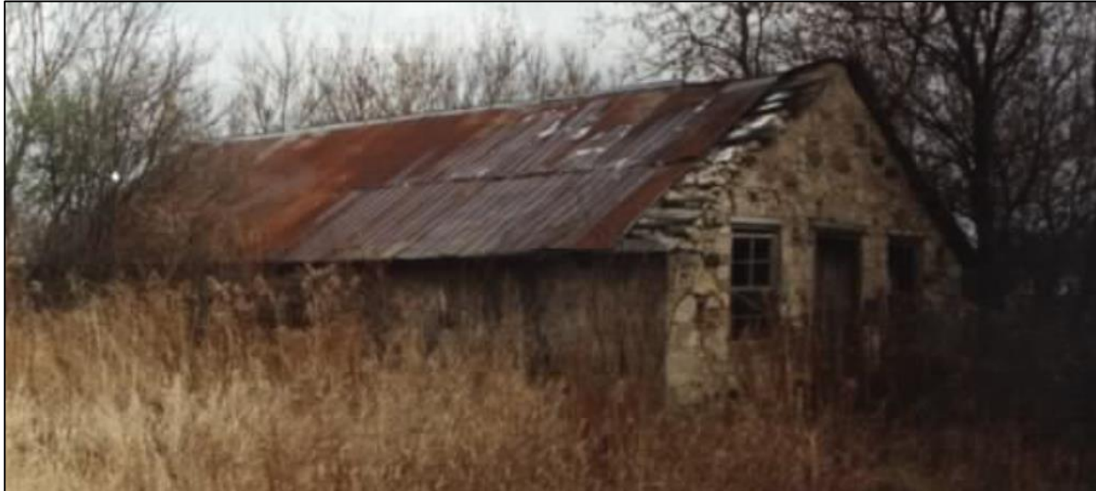
Figure 10: Former heavy timber barn at 99 Maltby Road West