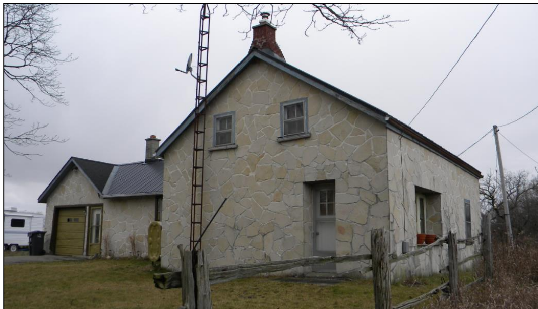
Figure 4: 99 Maltby Road West. (Heritage Planning 2012).

As depicted in Figure 4, the 1.5-storey main section of the farmhouse has gable walls on the south and north sides and an entrance door set into the thick stone gable wall facing the road. Two 2-over-2 wood window sashes are located in the upper gable wall. A modern chimney built with corbelled red brick rises from the south gable wall.