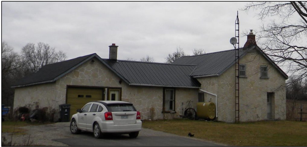
Figure 5: 99 Maltby Road West viewed from south. (Heritage Planning 2012)

The T-shaped building footprint includes a single-storey, gable roof kitchen tail extending from the west wall of the stone building (Figure 5). A concrete block chimney rises from the roof ridge above the west interior wall of the kitchen. The tail is further extended to the west with a garage under a transverse gable roof. The kitchen tail and garage have relatively thin walls and appear to be wood frame construction. The flagstone veneer served to unify the appearance of a stone exterior and quite likely was meant to cover alterations. Heritage Planning staff were provided two pictures of the Scott homestead, and despite the image quality they still provide some valuable insight as to what original construction method and materials are thought to be covered by the modern flagstone cladding (Figure 6).