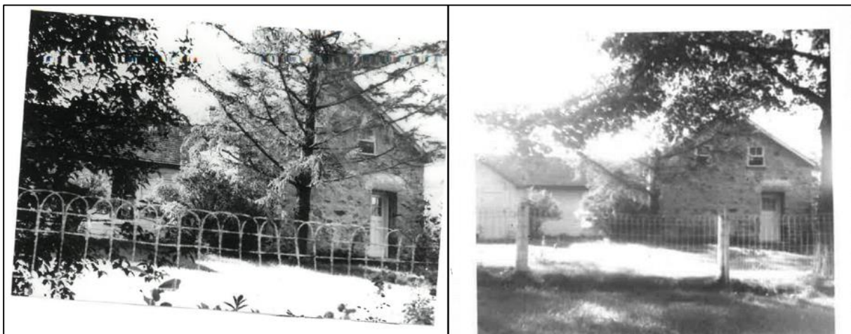
Figure 6: Historical photos of the James Scott farmhouse, date unknown (From Puslinch Heritage Committee photo album provided by Township of Puslinch staff, 2024)

The T-shaped building footprint includes a single-storey, gable roof kitchen tail extending from the west wall of the stone building (Figure 5). A concrete block chimney rises from the roof ridge above the west interior wall of the kitchen. The tail is further extended to the west with a garage under a transverse gable roof. The kitchen tail and garage have relatively thin walls and appear to be wood frame construction. The flagstone veneer served to unify the appearance of a stone exterior and quite likely was meant to cover alterations. Heritage Planning staff were provided two pictures of the Scott homestead, and despite the image quality they still provide some valuable insight as to what original construction method and materials are thought to be covered by the modern flagstone cladding (Figure 6).