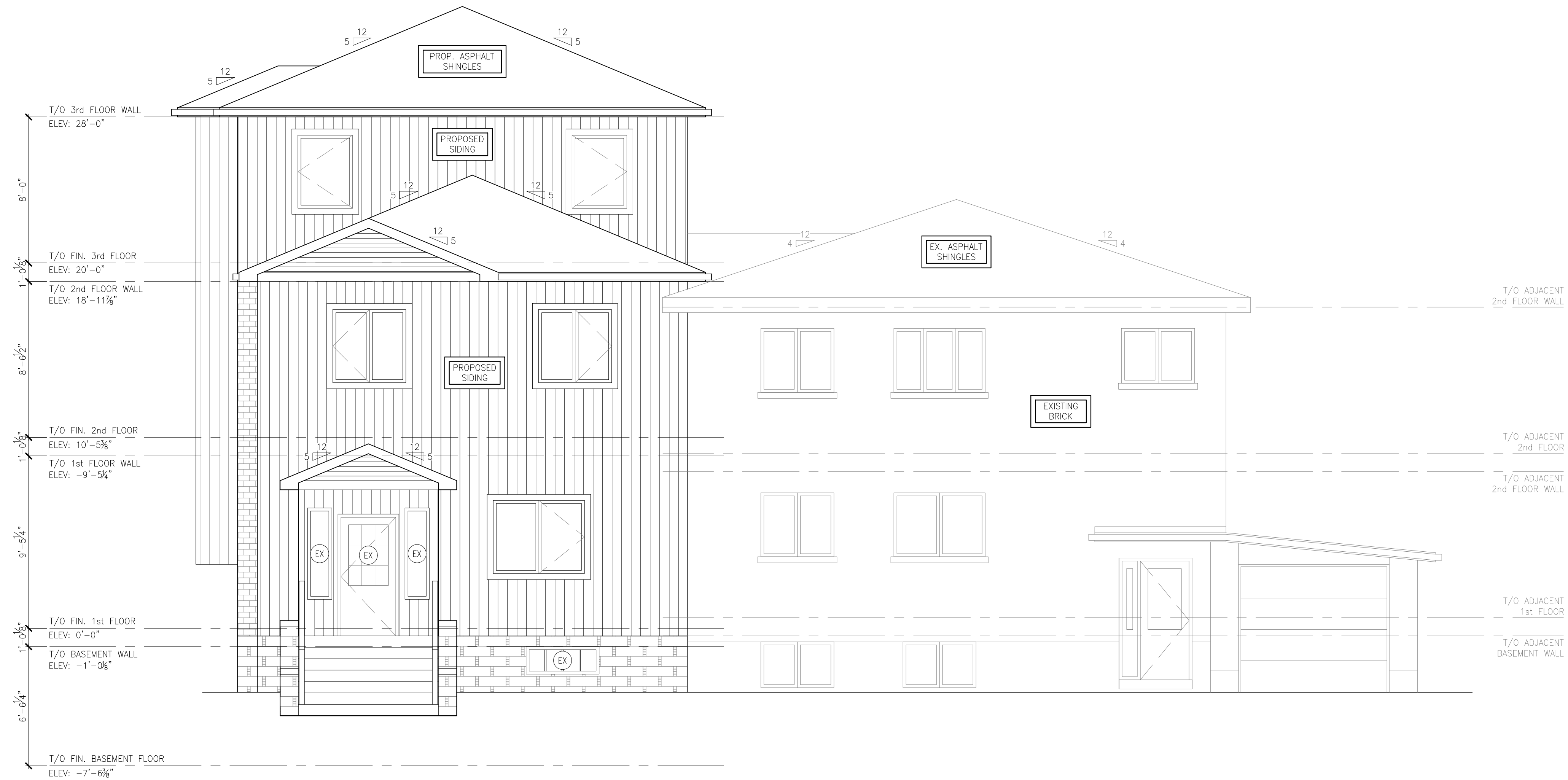
SOUTH ELEVATION 1 1/4"=1'-0" A3.1

ALL EXISTING HOUSE DIMENSIONS AREA APPROXIMATE AND MUST BE SITE CONFIRMED