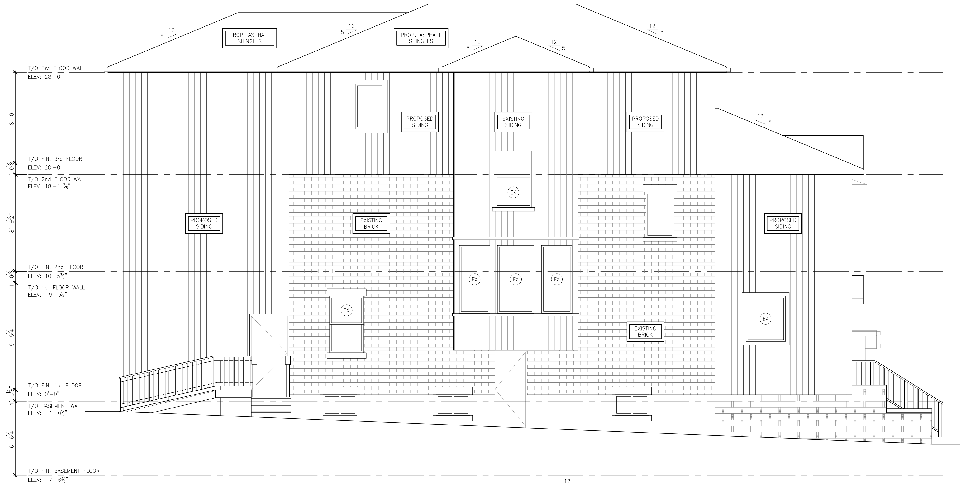
WEST ELEVATION 1/4"=1'-0" A3.2

ALL EXISTING HOUSE DIMENSIONS AREA APPROXIMATE AND MUST BE SITE CONFIRMED