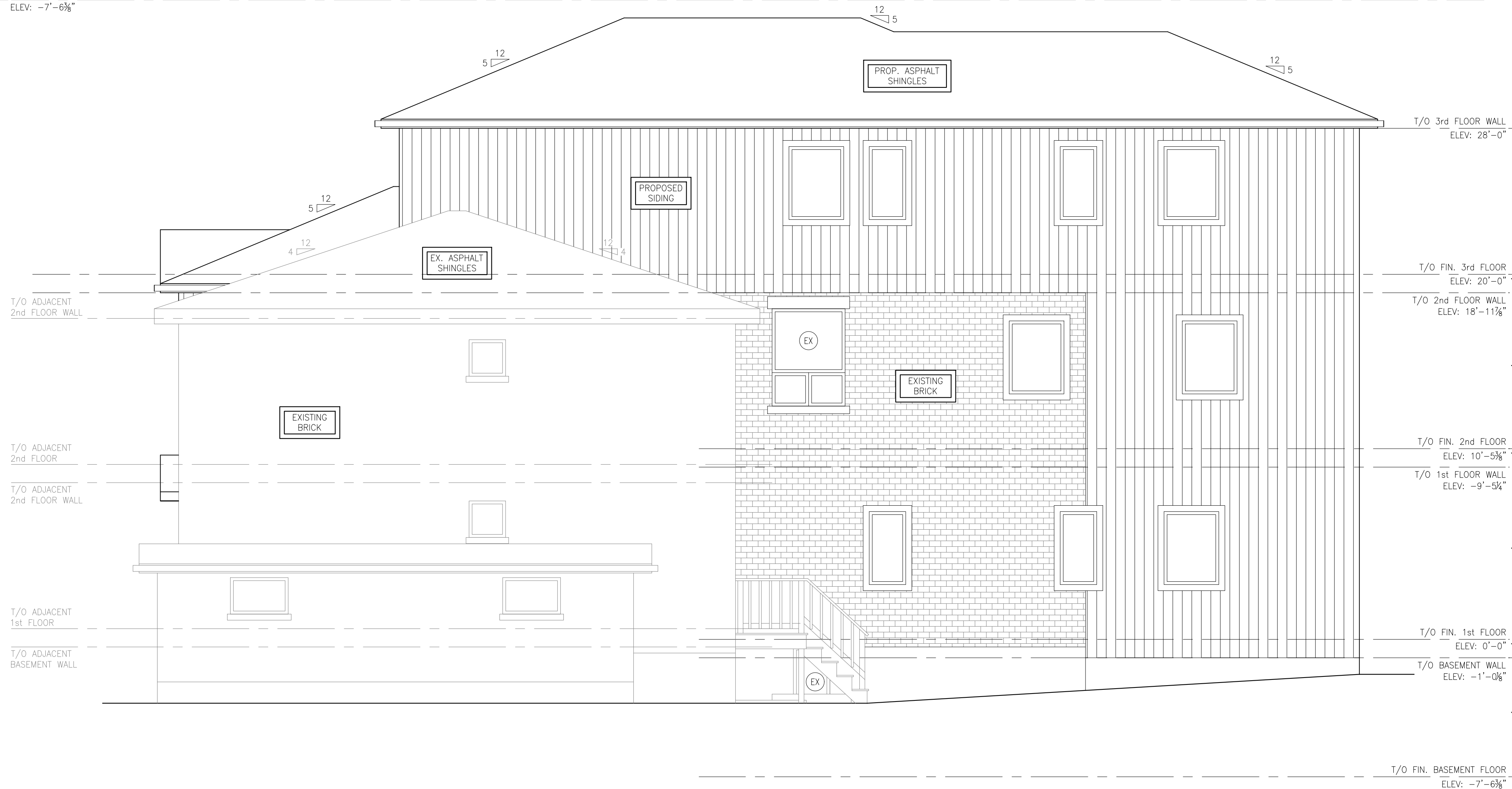
EAST ELEVATION 1/4"=1'-0" A3.2