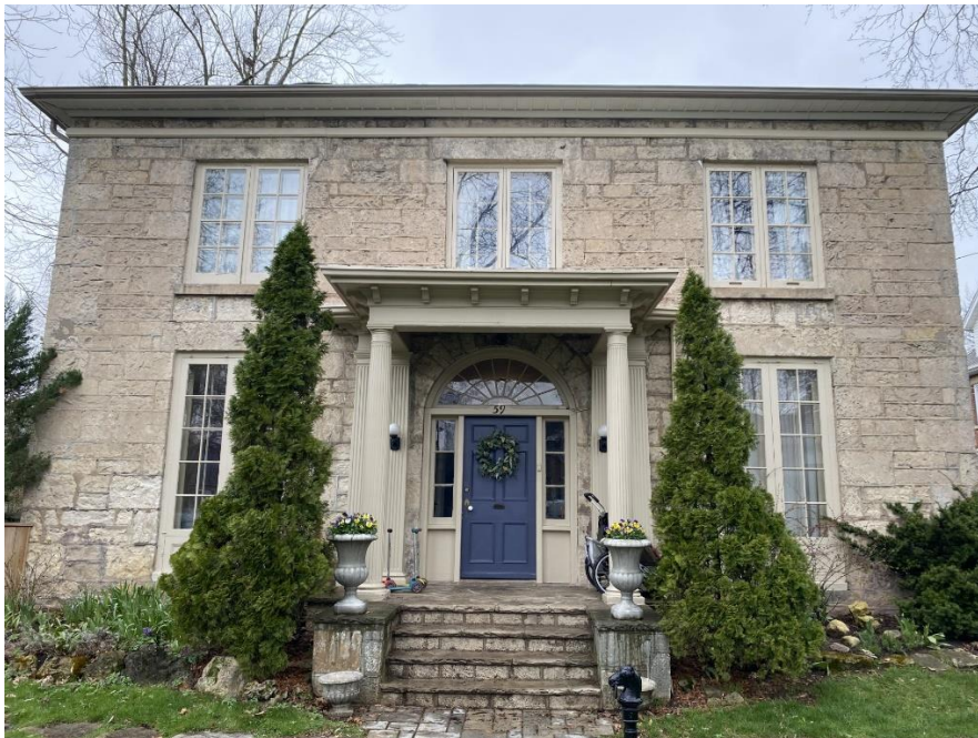
Figure 1: 59 Green Street. Heritage Staff, 2024.

59 Green Street is located on the north side of Green Street, to the west of Dublin Street North. The legal description of PLAN 156, PT LOT 9 & PT LOT 10.