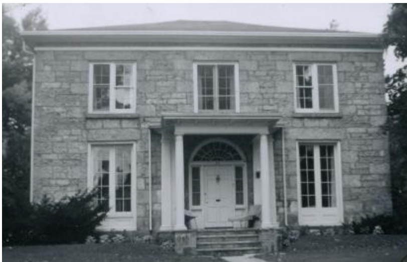
Figure 4: 59 Green Street, from the 1958 Girdwood Essay.

The Grierson's are reputed to have put significant work into restoring the house, both in its physical qualities but also its reputation, namely that years of neglect had led the neighborhood children to believe it was a haunted house (Attachment 1, Fig. 16). The house has since been thoughtfully maintained by subsequent owners since the Grierson's, a tradition continued by the current stewards.