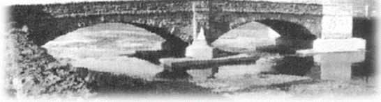
Linking the Old University Neighbourhood to the City of Guelph since 1897