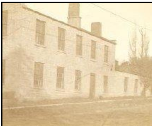
Figure 1: Photograph of the Guelph Foundry, circa 1920.