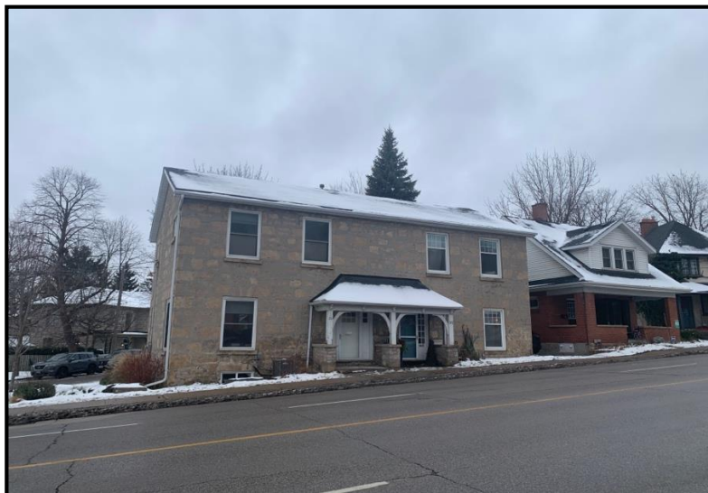
Figure 3: Photograph of 30 and 32 Eramosa Road

(Fire Insurance Plans 1875 and 1922), when the entryways facing Eramosa Road were constructed.