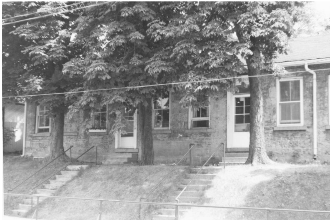
Figure 3 1974 Photo of 52 & 54 Paisley St.

52 Paisley Street is worthy of designation under Part IV, Section 29 of the Ontario Heritage Act because it meets three of the nine prescribed criteria for determining design and physical value, historical and associative value, and contextual value, as per Ontario Regulation 9/06 as amended by 569/22.