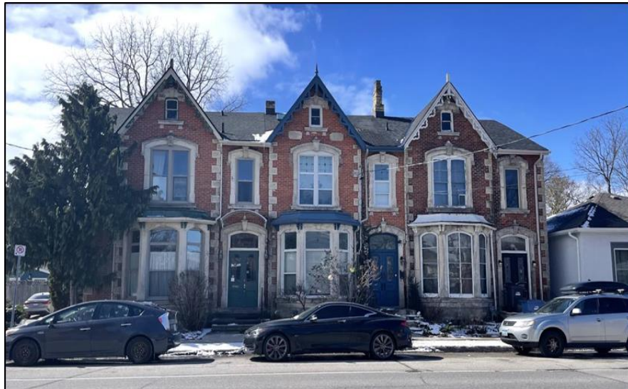
Figure 2 A recent photo of 330 Woolwich St.

Lots 43 and 44 of Plan 105 were first surveyed in August 1856 by Henry Strange P.L.S. for Mr. Charles McTague, yet the terrace making up 328-332 Woolwich Street would not be built until 1876, following the acquisition of the property by Frederick and Emily Chubb, who took out a $13,000 mortgage from the Guelph and Ontario Investment and Savings Society.