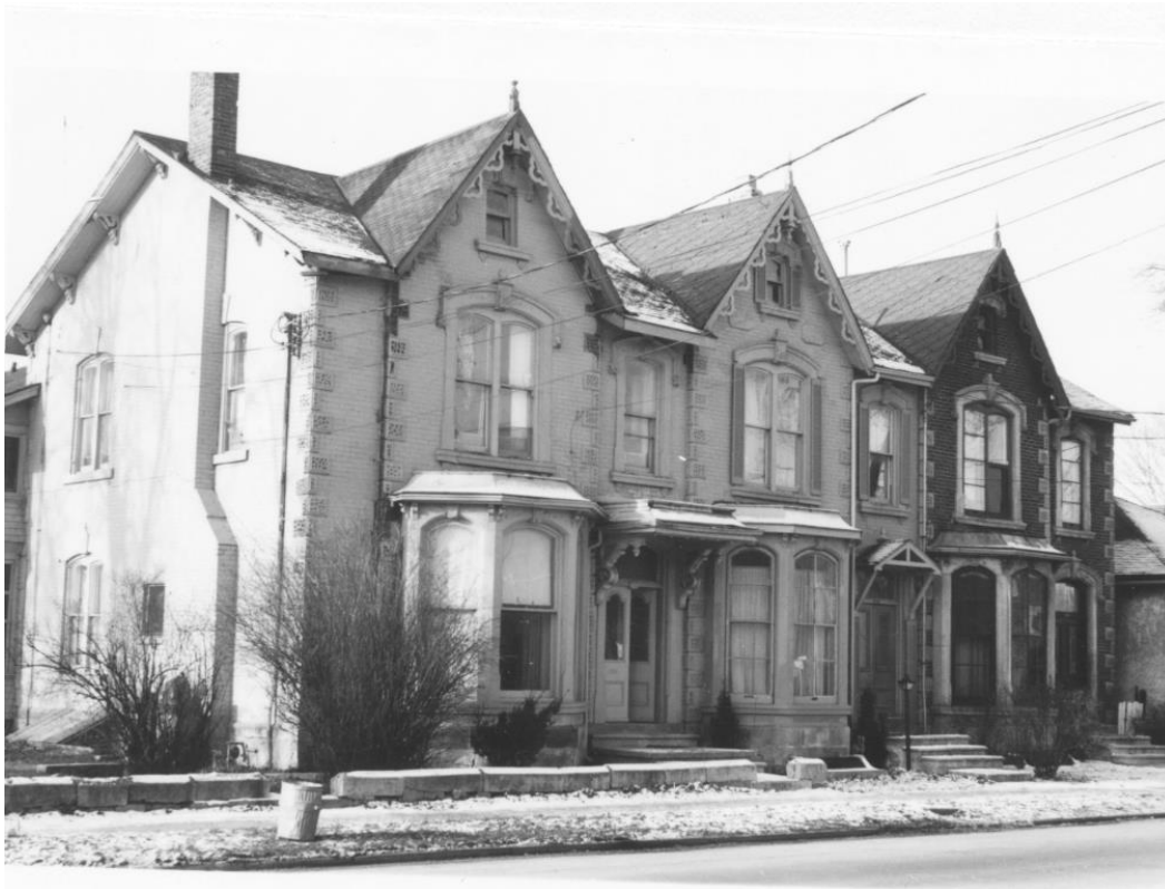
Figure 3 Photo of 330 Woolwich St. from Couling's 1975 inventory

The red brick and limestone unit at 330 Woolwich Street is worthy of designation under Part IV, Section 29 of the Ontario Heritage Act because it meets five of the nine prescribed criteria for determining cultural heritage value or interest, according