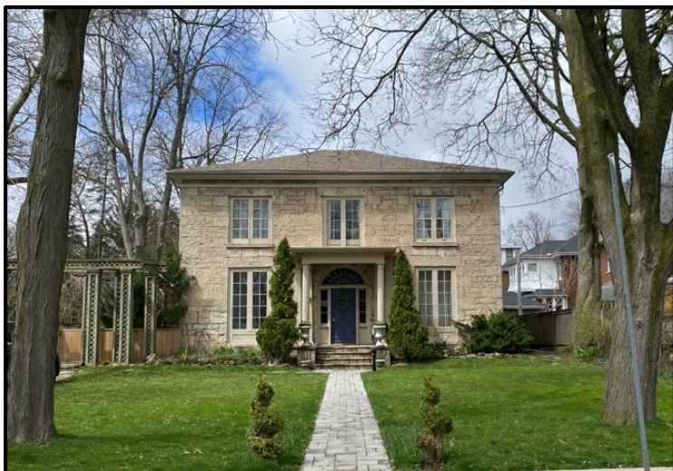
Figure 3: Photograph of 59 Green Street