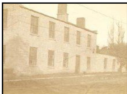
Figure 1: Photograph of the Guelph Foundry, circa 1920.