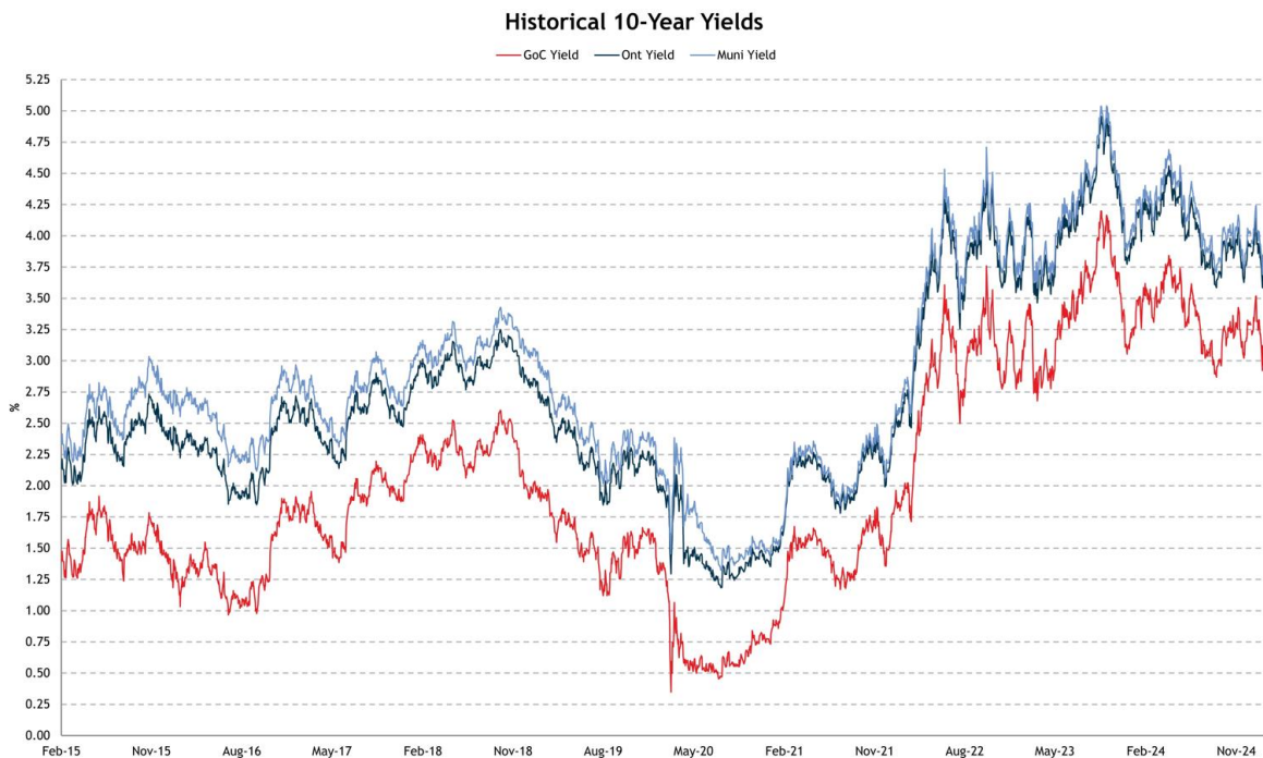
Figure 1: Historical 10-Year Yield of Government Bonds

yield when the City’s most recent debenture was placed in 2021. The prevailing yield on the Government of Canada bond currently sets approximately 80 per cent of the cost of borrowing for municipalities. So, fiscal policy at upper levels of government will have an impact on the cost of borrowing for the City.