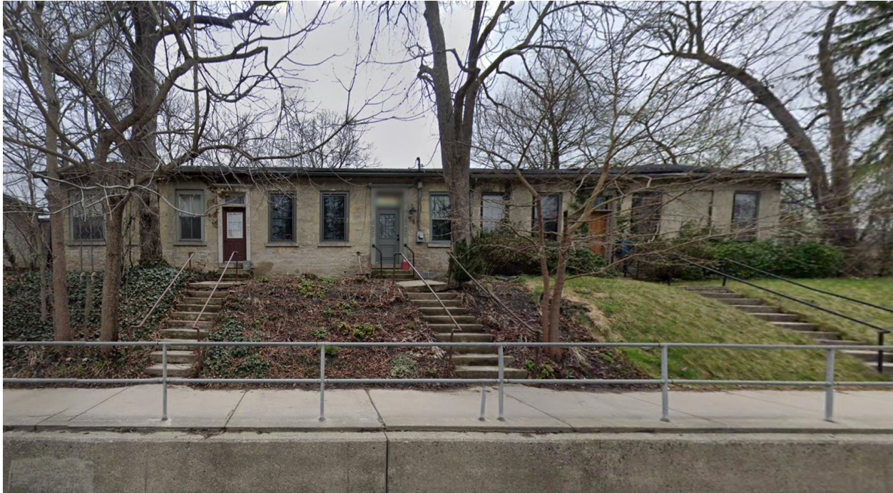
Figure 2: Photo of 52-56 Paisley St. May 2022.

The neighborhood surrounding 56 Paisley Street was first surveyed in the 1827 Galt plan. By the next year, the 1828 McDonald plan subdivided the area into lots. Paisley Street was one of the first westward roads to be developed in this area and it connected the "Paisley Block" of Scottish settlers to the growing commercial/industrial centre of Guelph. In 1857, the Great Western Railroad was built near Edinburgh Road. This spurred development in that area but left a gap in buildings from around Guelph Junction to Norfolk Street. Development in this area could have been challenging with the presence of one of Guelph's geologically significant drumlins. Paisley Street heads directly up one of these drumlins with Lot 593 located near its top. When the town of Guelph was established in 1855, this area was a part of the West Ward. In 1879, when Guelph became a city, this area was a part of the Saint Andrews Ward.