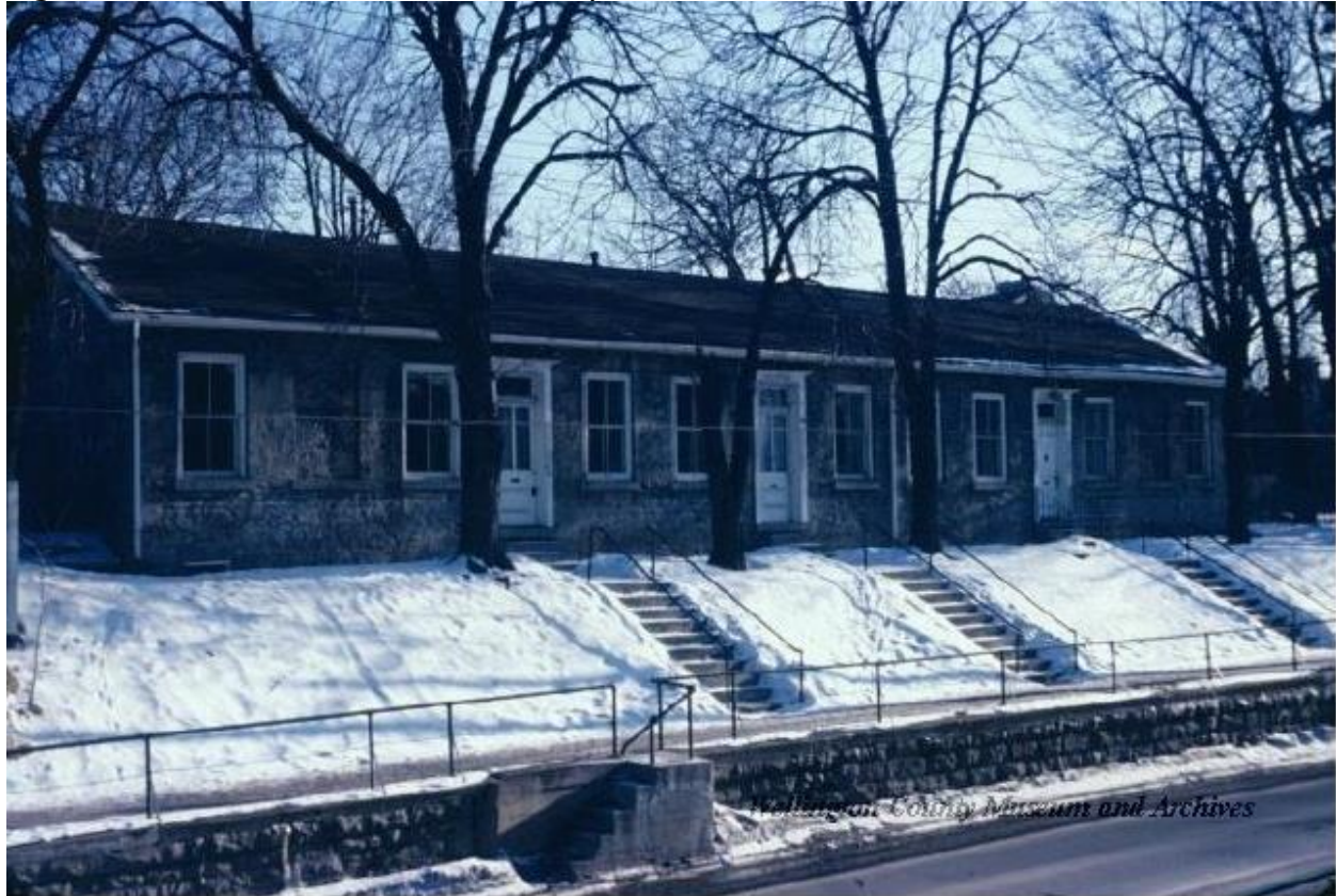
Figure 3: 1969 Photo of 52-56 Paisley St.

56 Paisley Street is worthy of designation under Part IV, Section 29 of the Ontario Heritage Act because it meets three of the nine prescribed criteria for determining design and physical value, historical and associative value, and contextual value, as per Ontario Regulation 9/06 as amended by 569/22.