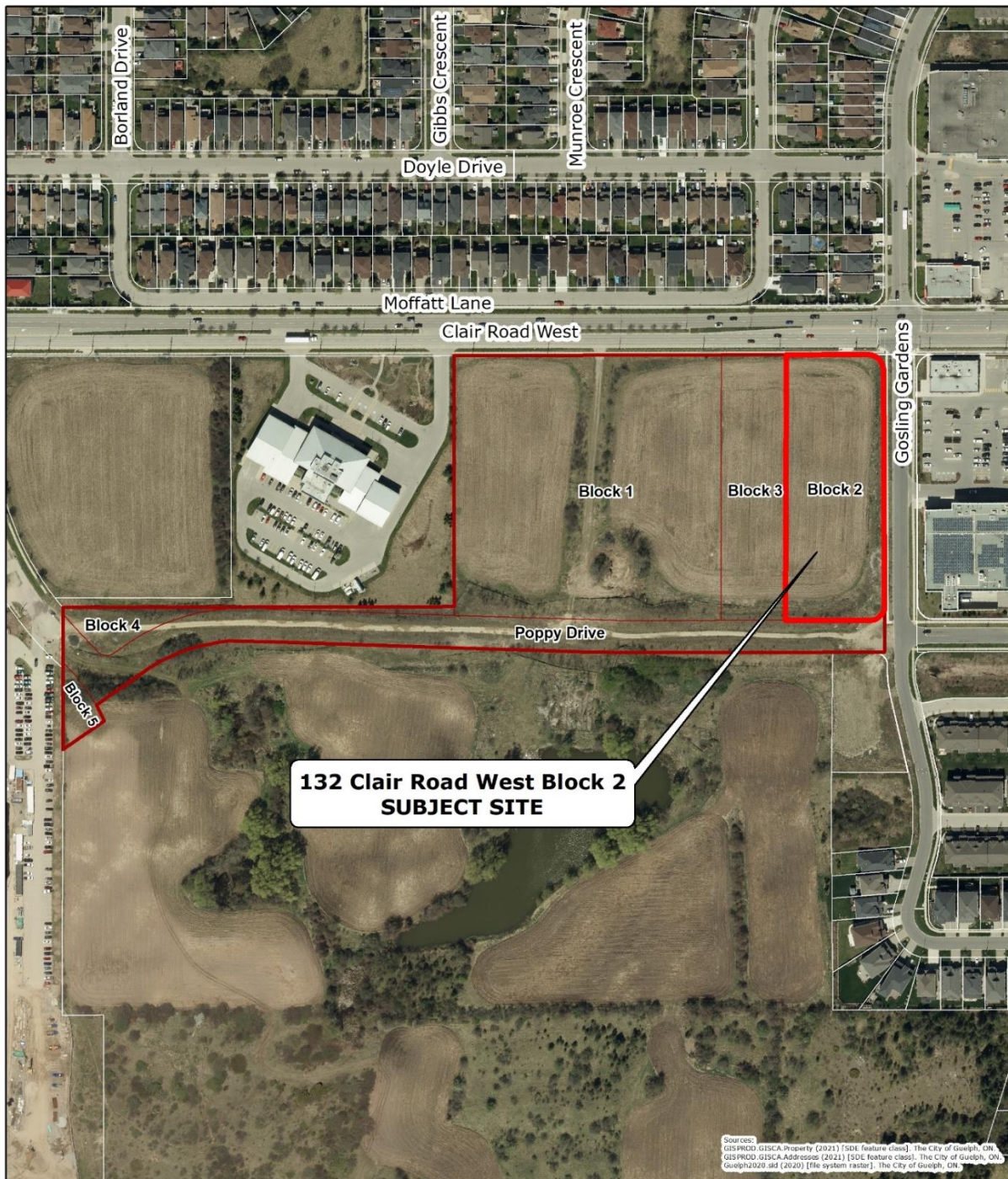
Figure 1: 2024 Aerial Photograph 132 Clair Road West