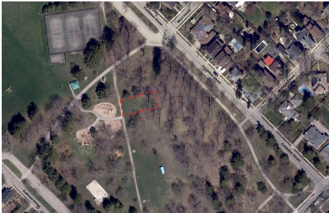
Figure 1: Exhibition Park context map.

The new double rail-rider will improve the overall accessibility of Exhibition Park playground. Additionally, as a community level park, this amenity will serve the greater Guelph community and will be a destination for residents beyond the local neighbourhood.