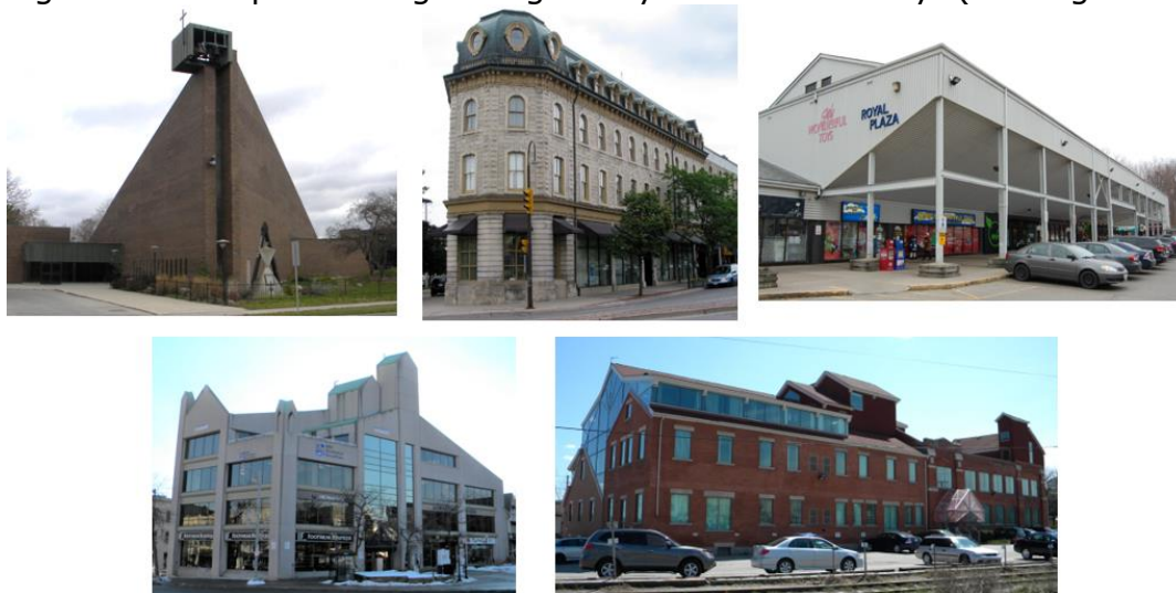
Figure 6 - Guelph buildings designed by Karl Briestensky. (Heritage Planning)