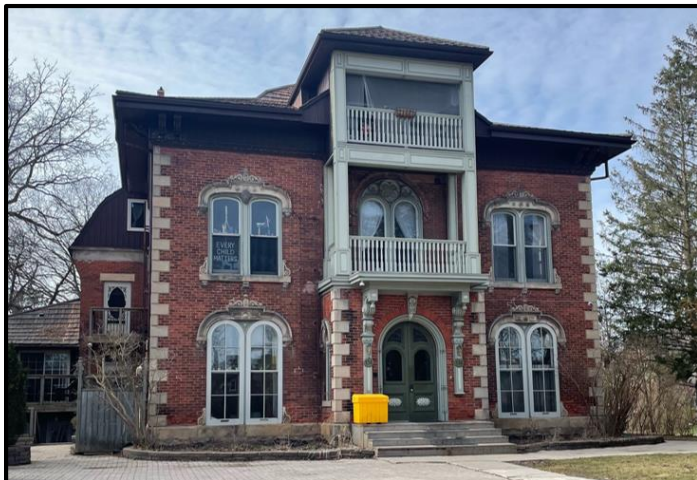
Figure 1: Photograph of 136 Glasgow Street North