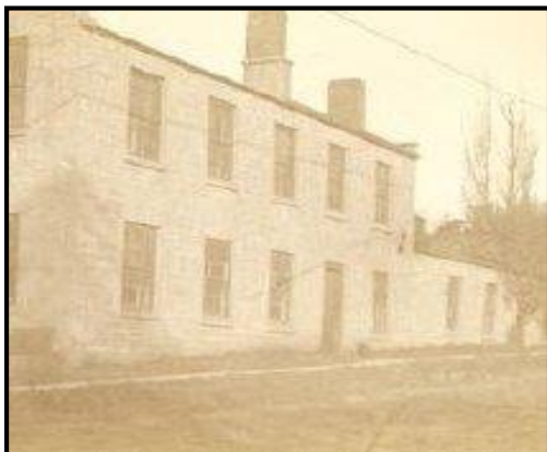
Figure 1: Photograph of the Guelph Foundry, circa 1920.