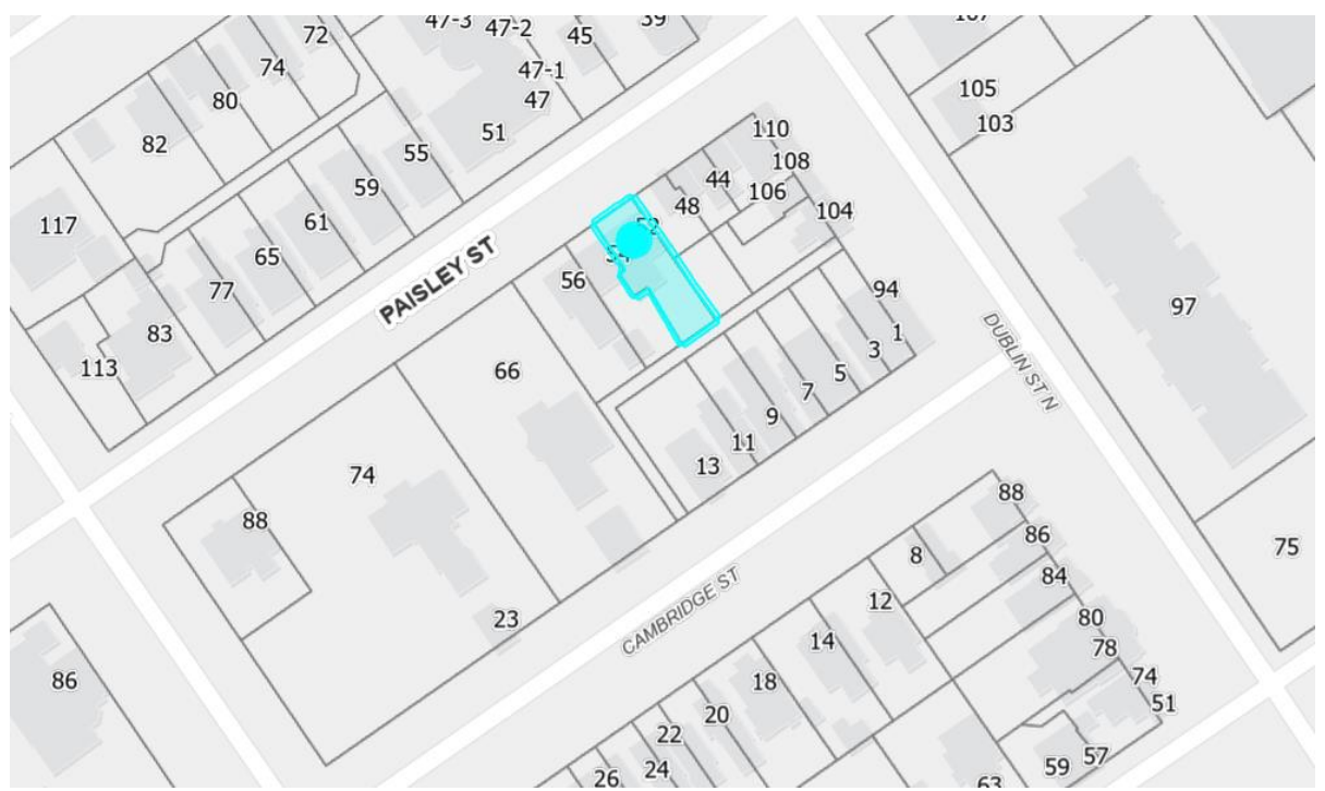
Figure 1: Portion of a GIS map showing the location of 52-56 Paisley St.

52 Paisley Street is on the south side of Paisley Street between Dublin Street North and Glasgow Street North. It bears the legal description of Plan 8, Lot 593.