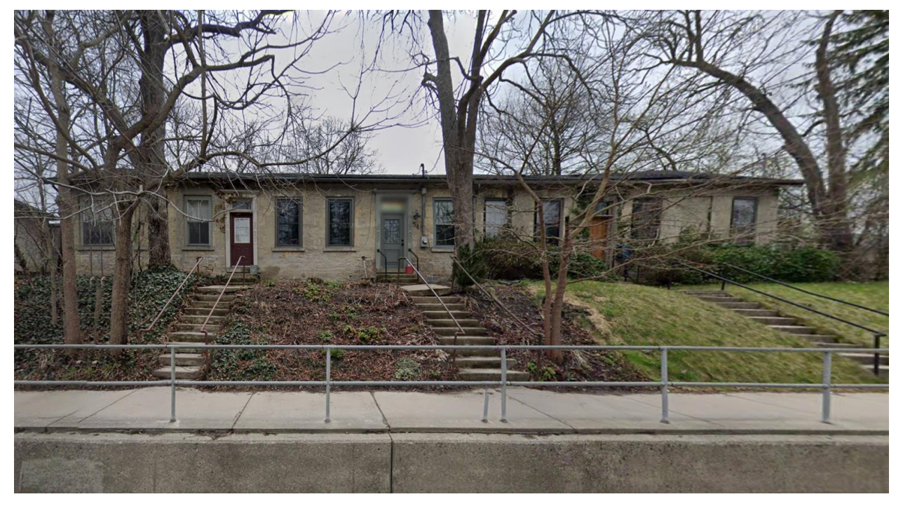
Figure 2: Photo of 52-56 Paisley St. May 2022.

The neighborhood surrounding 52 Paisley Street was first surveyed in the 1827 Galt plan. By the next year, the 1828 McDonald plan subdivided the area into lots. Paisley Street was one of the first westward roads to be developed in this area and it connected the Paisley Block of Scottish settlers to the growing commercial/industrial centre of Guelph. In 1857, the Great Western Railroad was built near Edinburgh Road. This spurred development in that area but left a gap in buildings from around Guelph Junction to Norfolk Street. Development in this area could have been challenging with the presence of one of Guelph's geologically significant drumlins. Paisley Street heads directly up one of these drumlins with Lot 593 located near its top. When the town of Guelph was established in 1855, this area was a part of the West Ward. In 1879, when Guelph became a city, this area was a part of the Saint Andrews Ward.