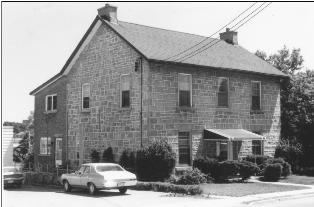
Figure 3 1974 Photo of 117 Surrey St. E. (Gordon Couling, 1974)

The neo-classical, residential dwelling (now commercial) at 117 Surrey St. E. is worthy of designation under Part IV, Section 29 of the Ontario Heritage Act because it meets five of the nine prescribed criteria for determining cultural heritage value or interest, according to Ontario Regulation 9/06 as amended by 569/22. The subject building at 117 Surrey St. E. has design and physical value, historical and associative value, and contextual value.