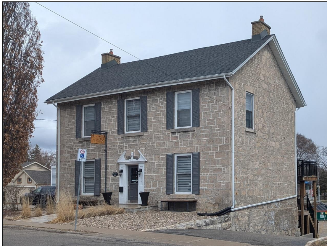
Figure 2 Current photo of 117 Surrey St. E.