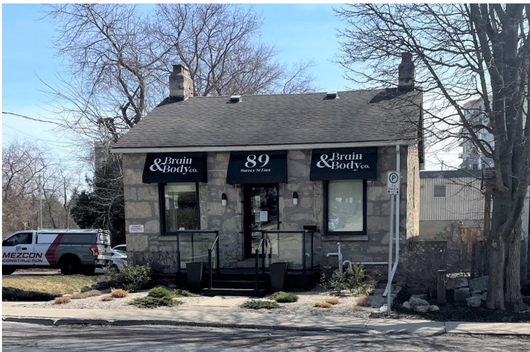
Figure 2 Current photo of 89 Surrey St. E. (Adrian Cameron, 2025)