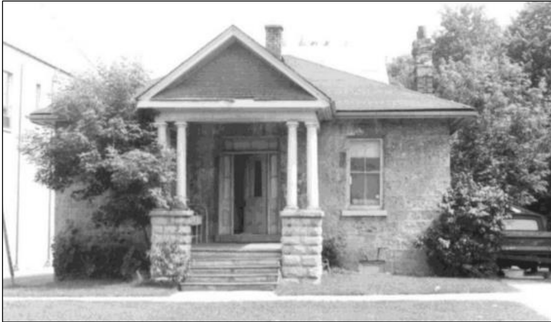
Figure 3: A photograph of 18 Paisley Street in 1974 from the Couling Architectural Inventory

The stone cottage at 18 Paisley Street is worthy of designation under Part IV, Section 29 of the Ontario Heritage Act because it meets three of the nine prescribed criteria for determining cultural heritage value or interest, according to Ontario Regulation 9/06 as amended by 569/22. The subject building at 18 Paisley Street has design and physical value, historical and associative value, and contextual value.