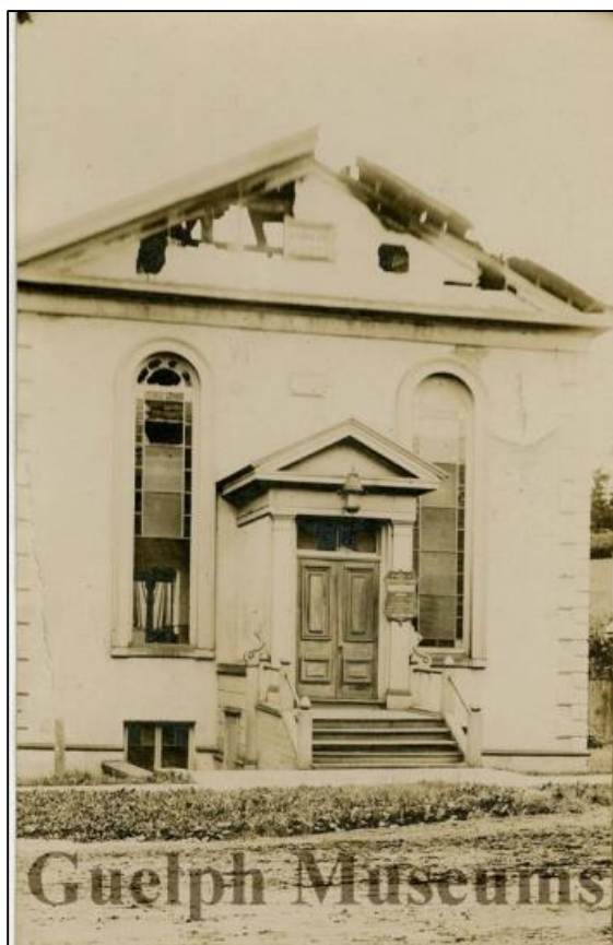
Figure 2: Photograph of The Paisley Street Methodist Church after the fire in 1907

The Paisley Street Primitive Methodist Church burnt down in 1907 and the congregation relocated to the Paisley Memorial United Church on 40