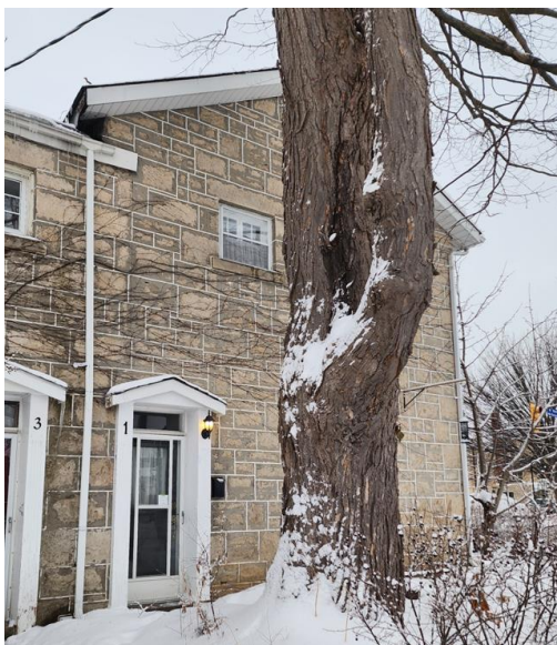
Figure 8 – Entrance door in southeast gable wall of 1 Norwich St W. (Heritage Planning 2025)

The prominence of the Barclay Terrace at the corner of Norwich Street West and Woolwich Street has been identified as part of Guelph's central residential area of the 1860s-1880s. Barclay's Terrace fronts onto Norwich Street West at the corner of its five-point intersection with Norwich Street East, Norfolk, and Woolwich. In 1930, Vernon's City of Guelph Directory listed Five Point Grocery at what is now 240 Woolwich Street. This property sits at a vergence between the radial plan of the downtown commercial core, and the residential grid.