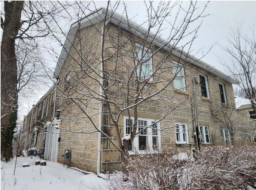
Figure 1 - 1 Norwich Street West. (Heritage Planning 2025)

The legal description of the property known as 1 Norwich Street West is PT LOTS 24 & 40, PLAN 35, PARTS 13 & 17 61R2027; T/W & S/T RO772283; T/W RIGHT OF WAY OVER PT 11, 61R2027 IN FAVOUR OF THE OWNERS OF PARTS 13 AND 17 FOR THE PURPOSES OF INGRESS AND EGRESS TO PARTS 10, 15 AND 16, 61R2027 AS IN LT70679.