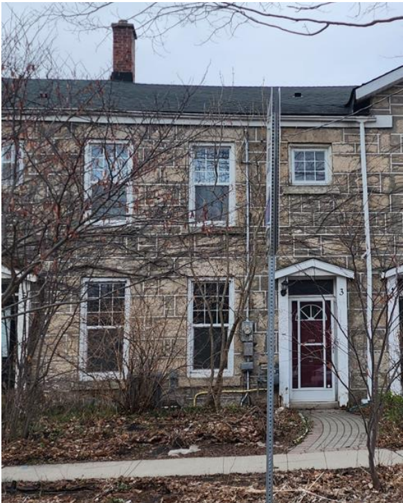
Figure 2 - Location of 3 Norwich St West (City of Guelph GIS)

Figure 1 - 3 Norwich Street West. (Heritage Planning 2025)