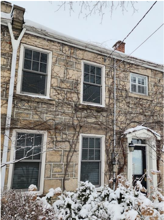
Figure 2 - Location of 5 Norwich St West (City of Guelph GIS)

Figure 1 - 5 Norwich Street West. (Heritage Planning 2025)