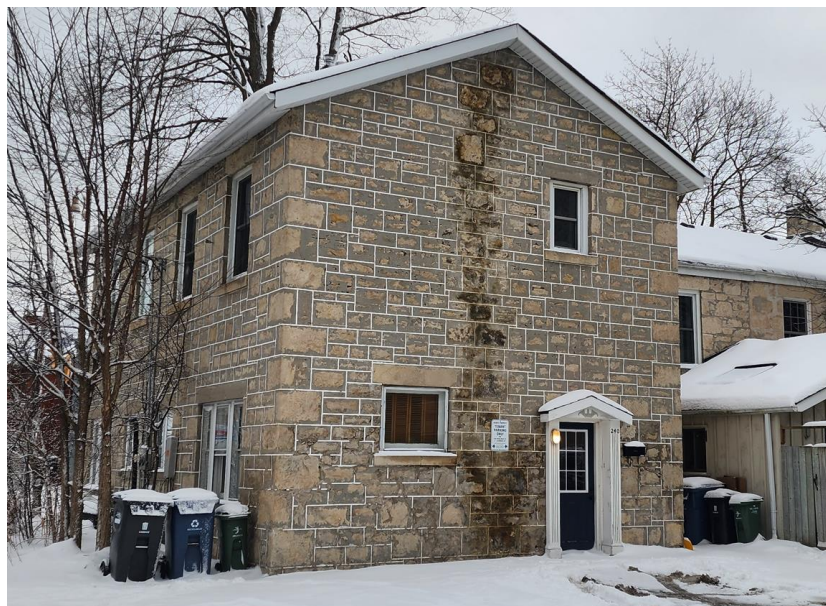
Figure 2 - Location of 240 Woolwich Street. (City of Guelph GIS)

Figure 1 - 240 Woolwich Street 9. (Heritage Planning 2025)