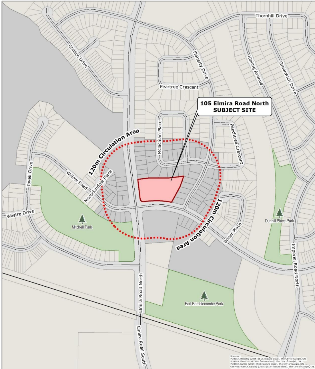
Figure 1: Location Map and 120 metre Circulation