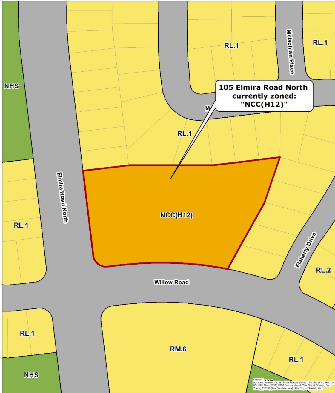
Figure 1: Existing Zoning, 2023 Zoning By-law