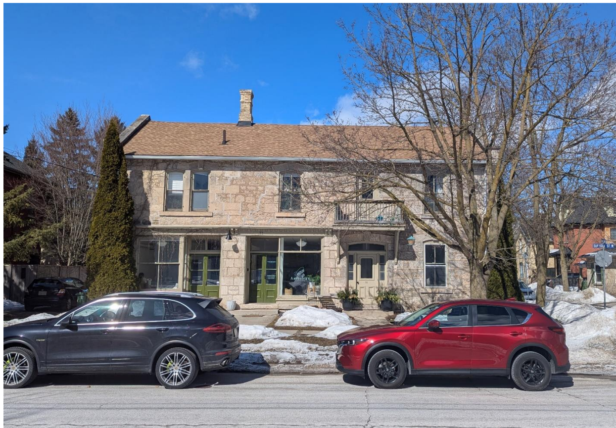
Figure 3 Current photo of 75-79 Suffolk St. W..

The building at 75-79 Suffolk St. W. is worthy of designation under Part IV, Section 29 of the Ontario Heritage Act because it meets five of the nine prescribed criteria for determining cultural heritage value or interest, according to Ontario Regulation 9/06 as amended by 569/22. The subject building at 75-79 Suffolk St. W. has design and physical value, historical and associative value, and contextual value.