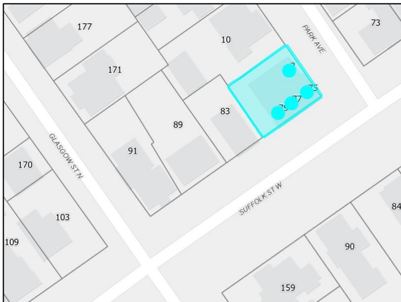
Figure 1 GIS map showing the location of the subject property

The subject property is located at 77 Suffolk St. W., between Glasgow St. N. and Park Ave. The legal description is Part Lot 3, Part Lot 4, Plan 145.