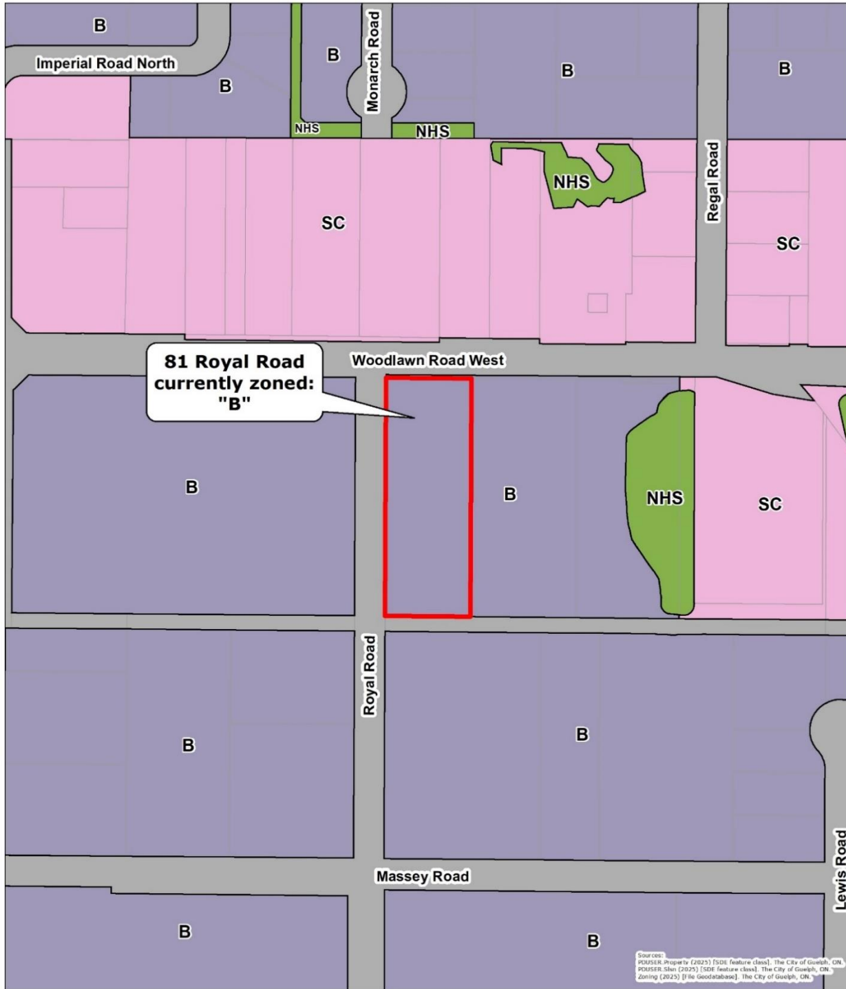
Figure 1: Existing Zoning, 2023 Zoning By-law