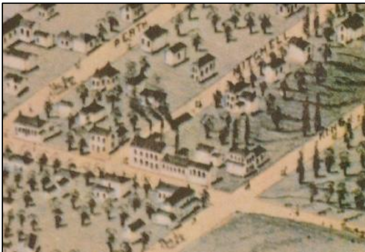
The Robertson Foundry in Brosius' 1872 Birdseye Map