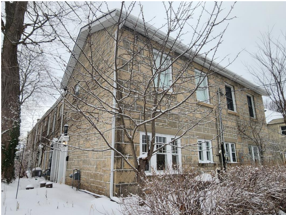
Figure 1 - 1 Norwich Street West. (Heritage Planning 2025)

The legal description of the property known as 1 Norwich Street West is PT LOTS 24 & 40, PLAN 35, PARTS 13 & 17 61R2027; T/W & S/T RO772283; T/W RIGHT OF WAY OVER PT 11, 61R2027 IN FAVOUR OF THE OWNERS OF PARTS 13 AND 17 FOR THE PURPOSES OF INGRESS AND EGRESS TO PARTS 10, 15 AND 16, 61R2027 AS IN LT70679.