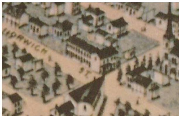
Figure 6 - Detail from Bird's Eye View of the Town of Guelph, 1872