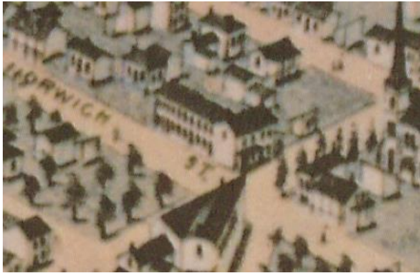
Figure 6 - Detail from Bird's Eye View of the Town of Guelph, 1872 (Guelph Civic Museum)