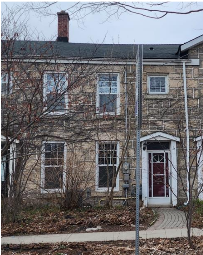
Figure 1 - 3 Norwich Street West. (Heritage Planning 2025)

The legal description of the property known as 3 Norwich Street West is PT LOTS 24 & 40, PLAN 35, PARTS 8, 9, 12 61R2027; T/W & S/T RO732886; GUELPH.