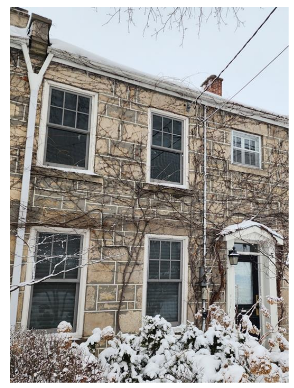
Figure 1 - 5 Norwich Street West. (Heritage Planning 2025)

The legal description of the property known as 5 Norwich Street West is PT LOTS 24 & 40, PLAN 35, PARTS 6 & 7 61R2027; T/W & S/T ROS401738; GUELPH.