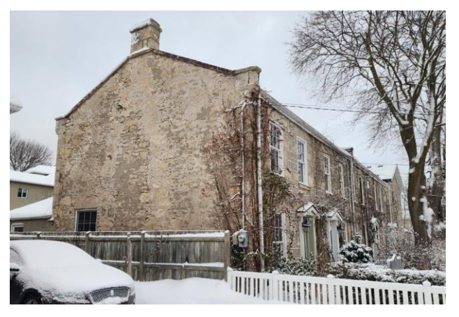
Figure 4 - Barclay Terrace viewed from east. (Heritage Planning 2025)