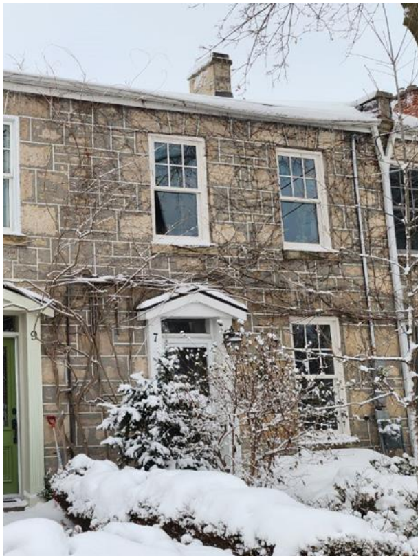
Figure 1 - 7 Norwich Street West. (Heritage Planning 2025)

The legal description of the property known as 7 Norwich Street West is PT LOTS 24 & 40, PLAN 35, PARTS 4 & 5 61R2027; T/W & S/T ROS254877; GUELPH.