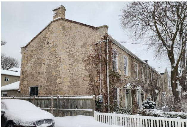
Figure 4 - Barclay Terrace viewed from east. (Heritage Planning 2025)