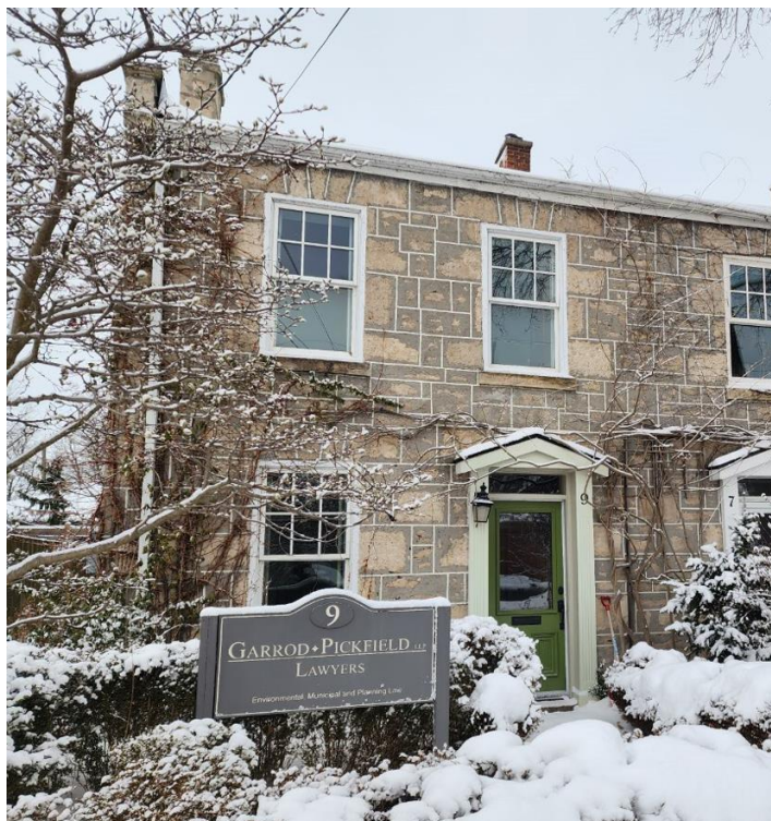
Figure 1 - 9 Norwich Street West. (Heritage Planning 2025)

The legal description of the property known as 9 Norwich Street West is PT LOTS 24 & 40, PLAN 35, PARTS 2 & 3 61R2027; T/W & S/T RO695652; GUELPH.