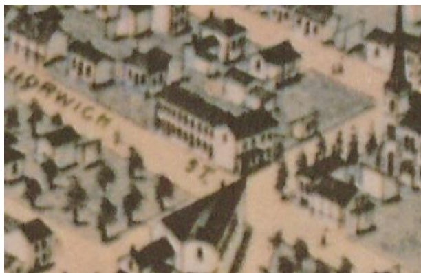
Figure 6 - Detail from Bird's Eye View of the Town of Guelph, 1872