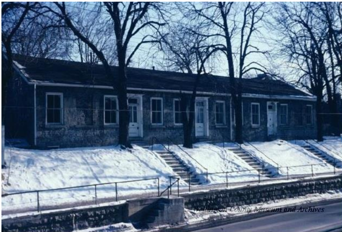
Figure 5: 52-56 Paisley Street in 1969 (Wellington County)