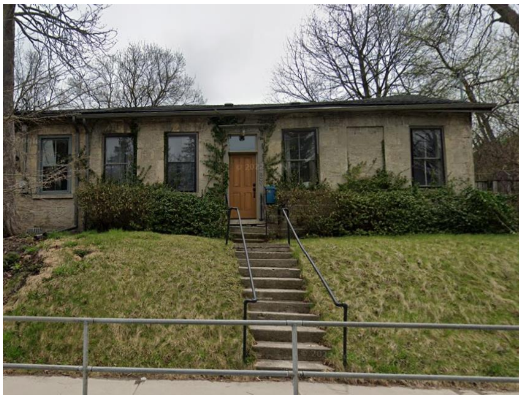
Figure 1: 56 Paisley Street in 2022