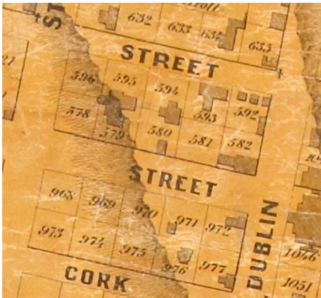
Figure 2: Cooper's Map 1875