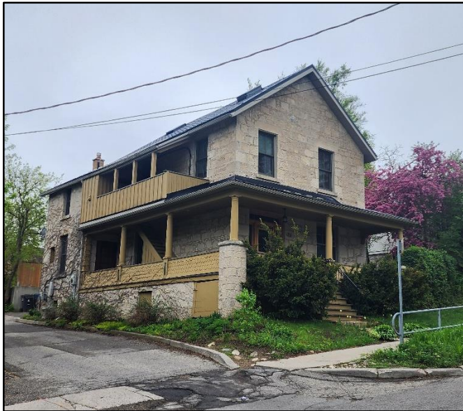
Figure 2 May 2025 Photo of 19 London Rd. E.