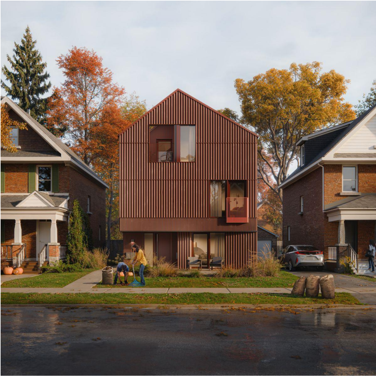
Figure 1: CMHC Fourplex Design Rendering