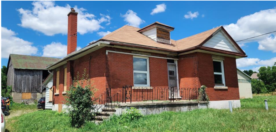
Figure 2 - 316 Grange Road – house with barn behind. (Heritage Planning July 2025)

316 Grange Road contains a single-storey, red brick dwelling facing Grange Road (Figure 2). Although the dwelling was included in the Couling Architectural Inventory in the 1970s, the building has no heritage status as it is not listed or designated under the Ontario Heritage Act.