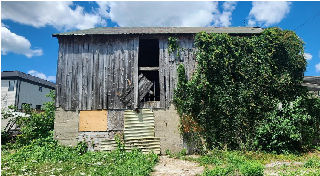
Figure 3 – 316 Grange Road – front of barn. (Heritage Planning July 2025)

The barn behind the house at 316 Grange Road (Figures 3 and 4) is listed as non-designated on the Municipal Register of Cultural Heritage Properties. The barn building has a side gable roof over a heavy timber upper storey that was built on a board-formed concrete base on the ground floor.