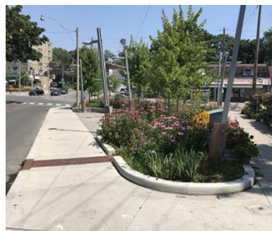
Low Impact Development

Supplemental measures guide driver behaviour