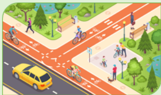
Complete Street Design Guidelines

Prevent speeding by physically changing road designs